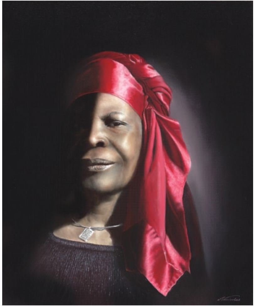
HER HONOR, OIL ON CANVAS, 24 X 20"